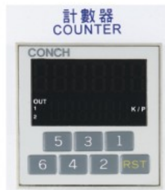
HC-OP 12 / Meter Counter