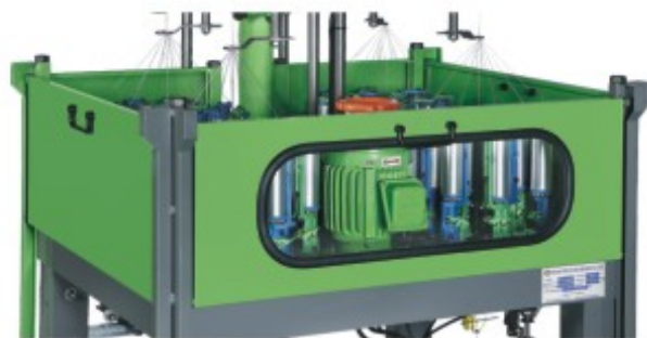
HC-OP 6 / Half Cover