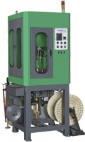
HC-OP 7 / Full Cover