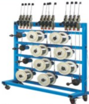
HC-OP 9 (10) / Threads Lay Out Stand